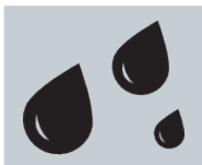
Wet Power Frequency Flashover