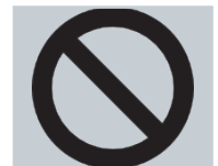
Tracking and Erosion Resistance